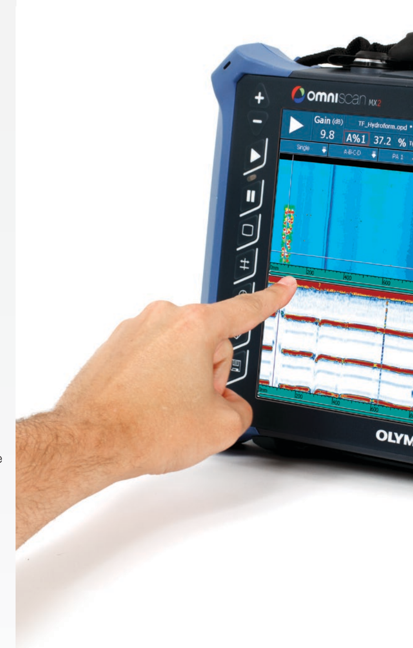
PA2 32:128 PA2 32:128PR