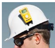
Hard Hat Clip