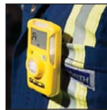
Easy To Wear